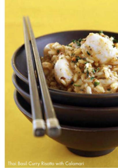
Thai Basil Curry Risotto with Calamari

The WORLDFOODS' Specialty Ingredients, cooking solution for home cooks to create their own unique creations. Our fresh concentrated ingredients are suitable in many ways to create an authentic Asian or Asian influenced dish. This can be stir-fried, marinade, baked, or as garnishing.