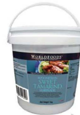
Indonesian Sweet Tamarind Marinade