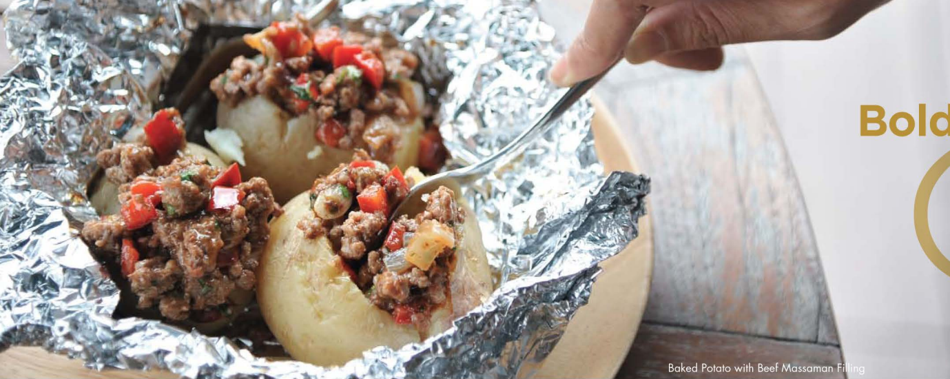
Baked Potato with Beef Massaman Filling