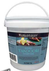
Indian Tandoori Marinade