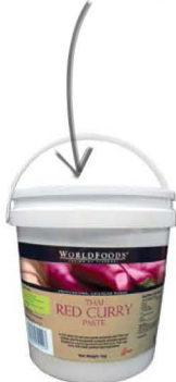
Thai Red Curry Paste