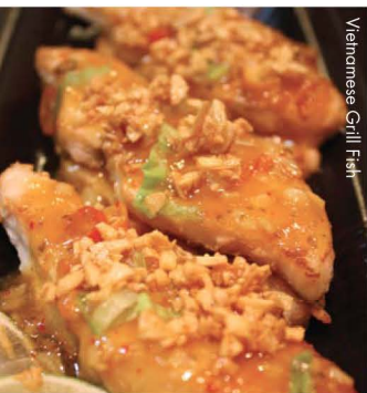
Vietnamese Grill Fish