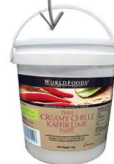
Thai Creamy Chilli Kaffir Lime Paste