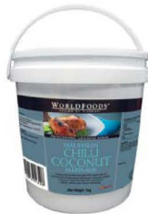
Malaysian Chilli Coconut Marinade