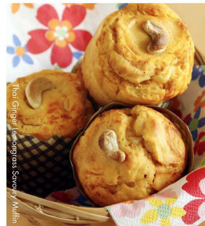
Thai Ginger Lemongrass Savoury Muffin