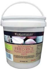
Indonesian Fried Rice 'Nasi Goreng' Paste