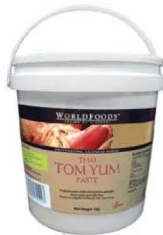
Thai Tom Yum