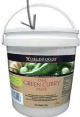
Thai Green Curry Paste