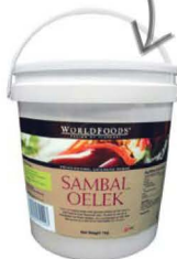
Indonesian Sambal Oelek