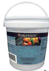
Thai Turmeric Lemon Grass Marinade