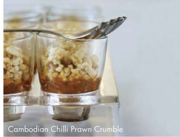
Cambodian Chilli Prawn Crumble

The WORLDFOODS' stir-fry sauces are available in a wide range of flavours representing the different regional cuisines of Asia. Use them as they are to create an authentic meal or as a base to create fusion of Asian flavours with your favourite recipes.