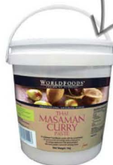
Thai Masaman Curry Paste