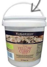
Thai Yellow Curry Paste