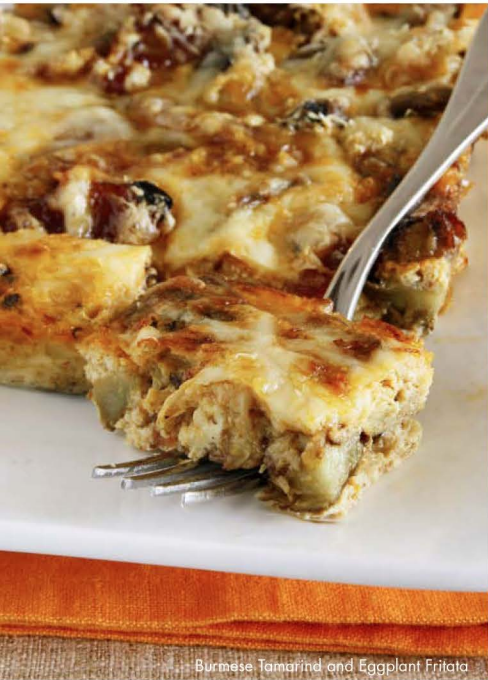
Burmese Tamarind and Eggplant Fritata