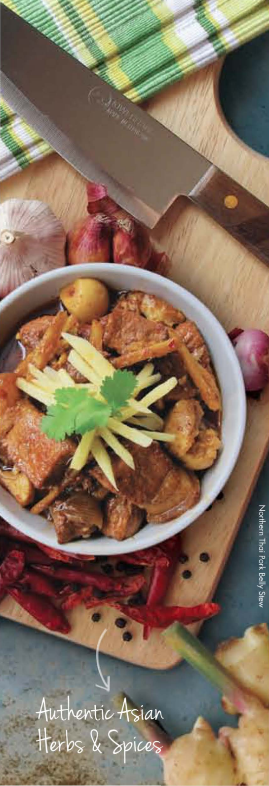
Northern Thai Pork Belly Stew